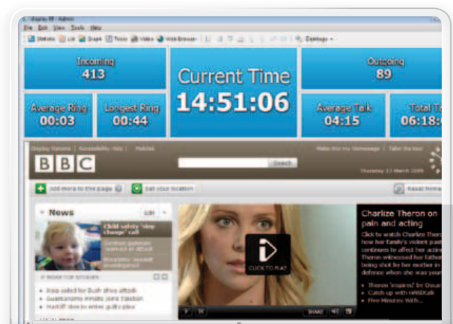
Combined - Web pages, video feeds, XML database feeds and more, combined with call logging statistics.